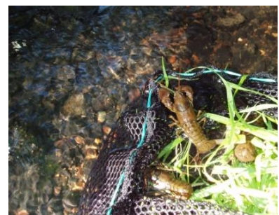
White-clawed crayfish being released into a new ark site