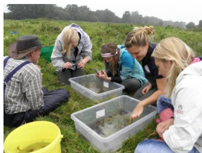
White-clawed crayfish have a health check by volunteers