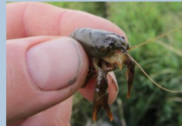
First juvenile crayfish to be found in an ark site river for twenty years.

We have been monitoring these populations to check how they are doing so far we have only found low numbers. This is to be expected at this early stage. After reintroduction it is thought that it may take crayfish five years to become established. In this period there is a greater risk of dying out so it is important to keep monitoring and take action when necessary.