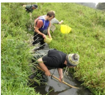
Volunteers catching white-clawed crayfish